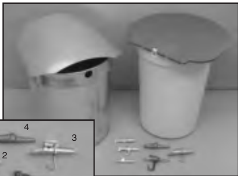
Close-up of spiles