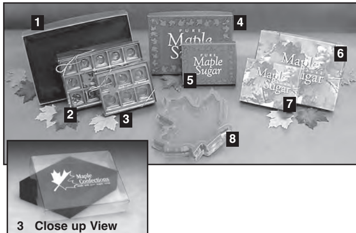
3 Close up View